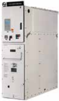
AIR INSULATED SWITCHGEAR