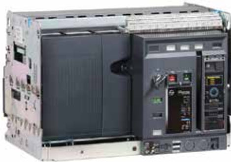
AIR CIRCUIT BREAKER