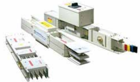
BUSBAR TRUNKING UNIT